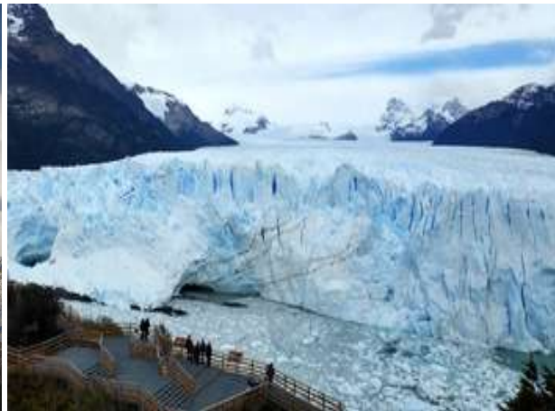
Mountainscape at El Chalten / Perito Moreno Glacier width 5km length 30km

This will be a small group backpack trip using 6 domestic flights, local buses and airport taxis . We stay in decent clean guesthouses, apartments and budget hotels ranging from 2 to 4 pax sharing units . It is essential that members travel light as several of the domestic flights have 15 kilos check in baggage limit . Participants must be able to manage their own luggage and light medium trolleys are acceptable . Like most Yongo trips, you pay for your own meals. We have included most of the main entrance fees on this trip. Tours/entrances not mentioned below will be payable by members. You also pay within-the-town taxis and other activities not specified below.