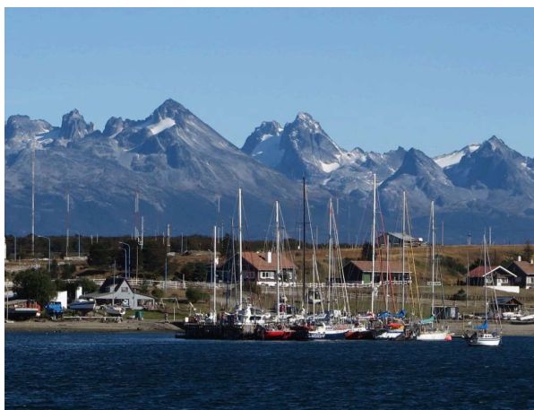
Colourful street art around Valparaiso / Land's end at Ushuaia

Day 6 El Calafate (Argentina) 15 Mar We take the morning public bus 6hr to El Calafate, located in Argentina Patagonia. El Calafate is the gateway to the Los Glaciares National Park. Short rest before our next late afternoon bus 3hr to El Chalten. O/N El Chalten guesthouse for next 2 nights