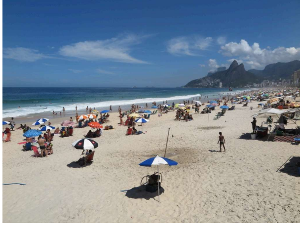
Selaron Steps / locals at Ipanema Beach