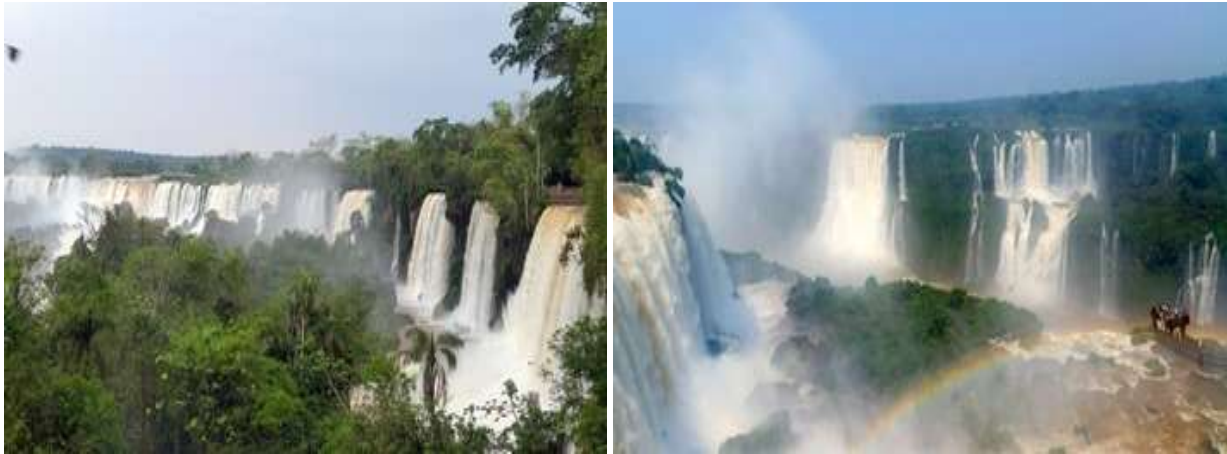
Iguazu Falls Argentina / Iguacu Falls Brazil

Day 13 Buenos Aires 22 Mar We will organise a half day morning city tour of Buenos Aires with transport included. This include the many city highlights including Plaza de Mayo, Recoleta Cemetery facade and La Boca. La Boca, home to the colourful Caminito Calle, is a photogenic area with narrow alleys flanked by brightly painted zinc shacks that evoke the district's early immigrant days. Rest of afternoon free & easy to explore or join various free walking tours starting late afternoon. Final night in Buenos Aires.