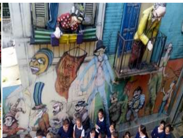
La Boca with its colourful murals & houses

Day 11 Fly Buenos Aires 20 Mar Morning free & easy. Take Aerolineas Argentinas flight towards the capital city of Buenos Aires. This cosmopolitan capital of Argentina feels more European than Latin America due to the many Italian immigrants who settled